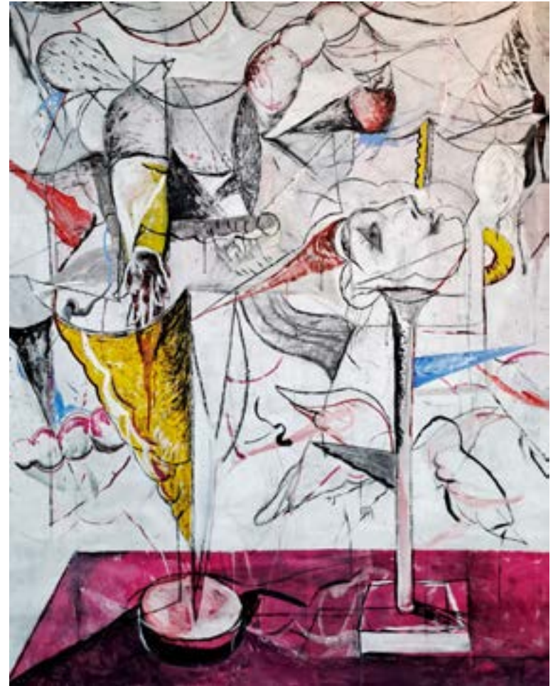
Oussama Diab Theatre. Carnival, 2024 Mix media on canvas 150 X 120 cm