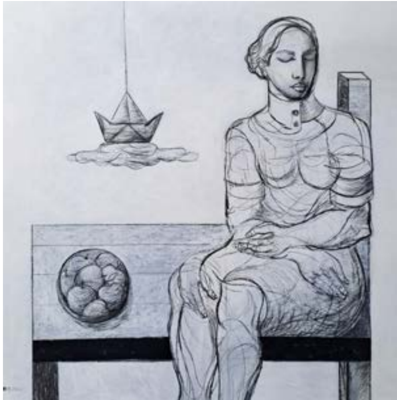
Oussama Diab Theatre. Boat trip II, 2023 Mix media on canvas 130 X 130 cm