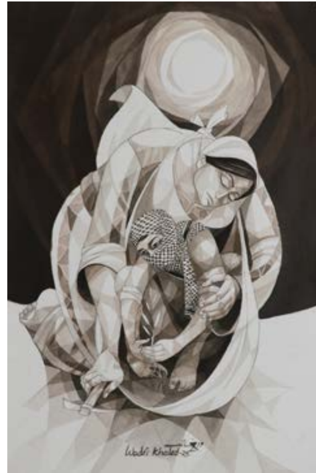
Wadeei Khaled untitled, 2023 Colors and Ink on Paper 35 X 52 cm