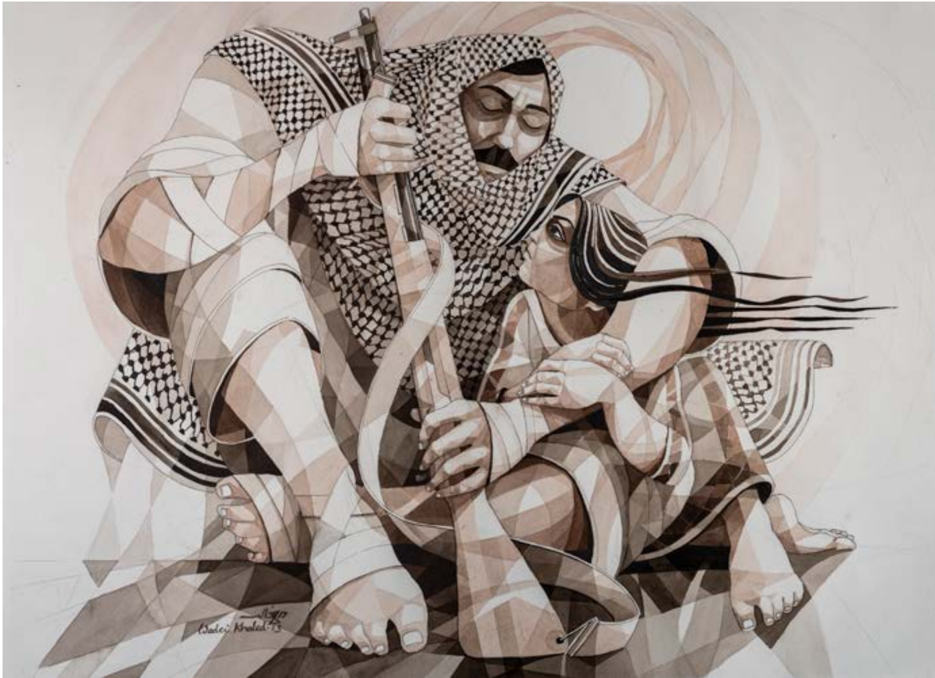
Wadei Khaled untitled, 2023 Colors and Ink on Paper 53 X 72.5 cm