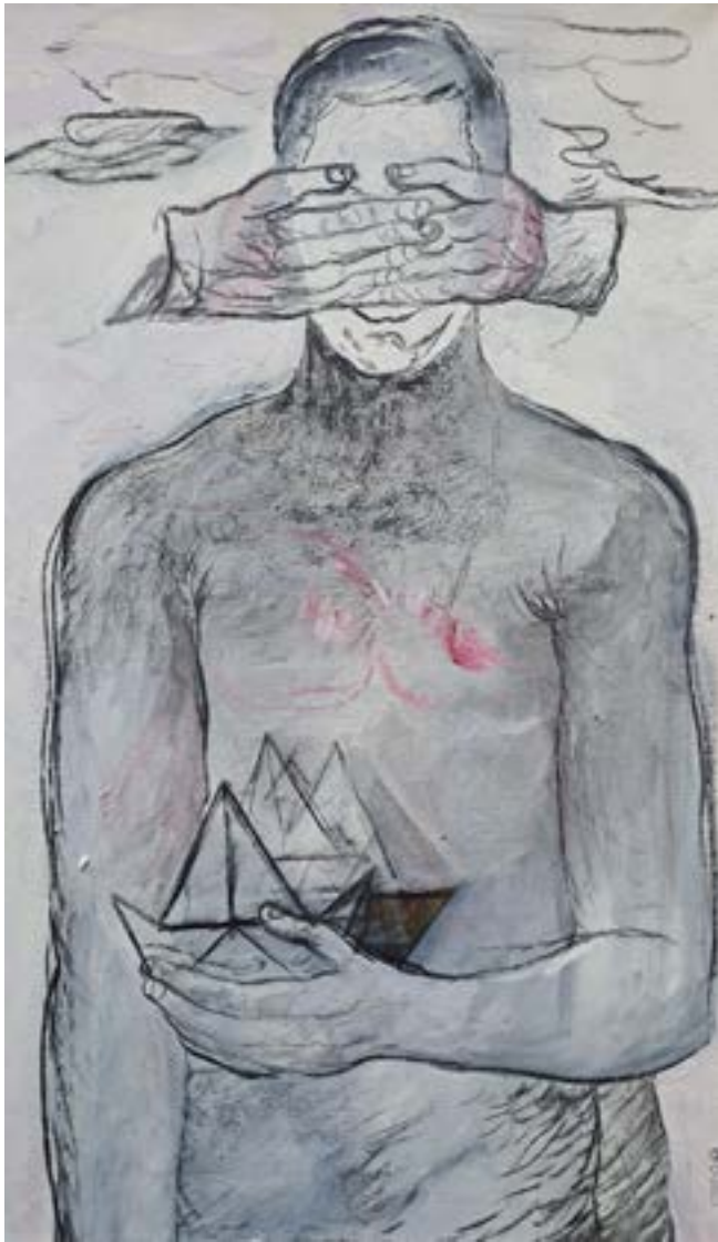
Oussama Diab Theatre. Hidden, 2023 Mix media on canvas 100 X 60 cm