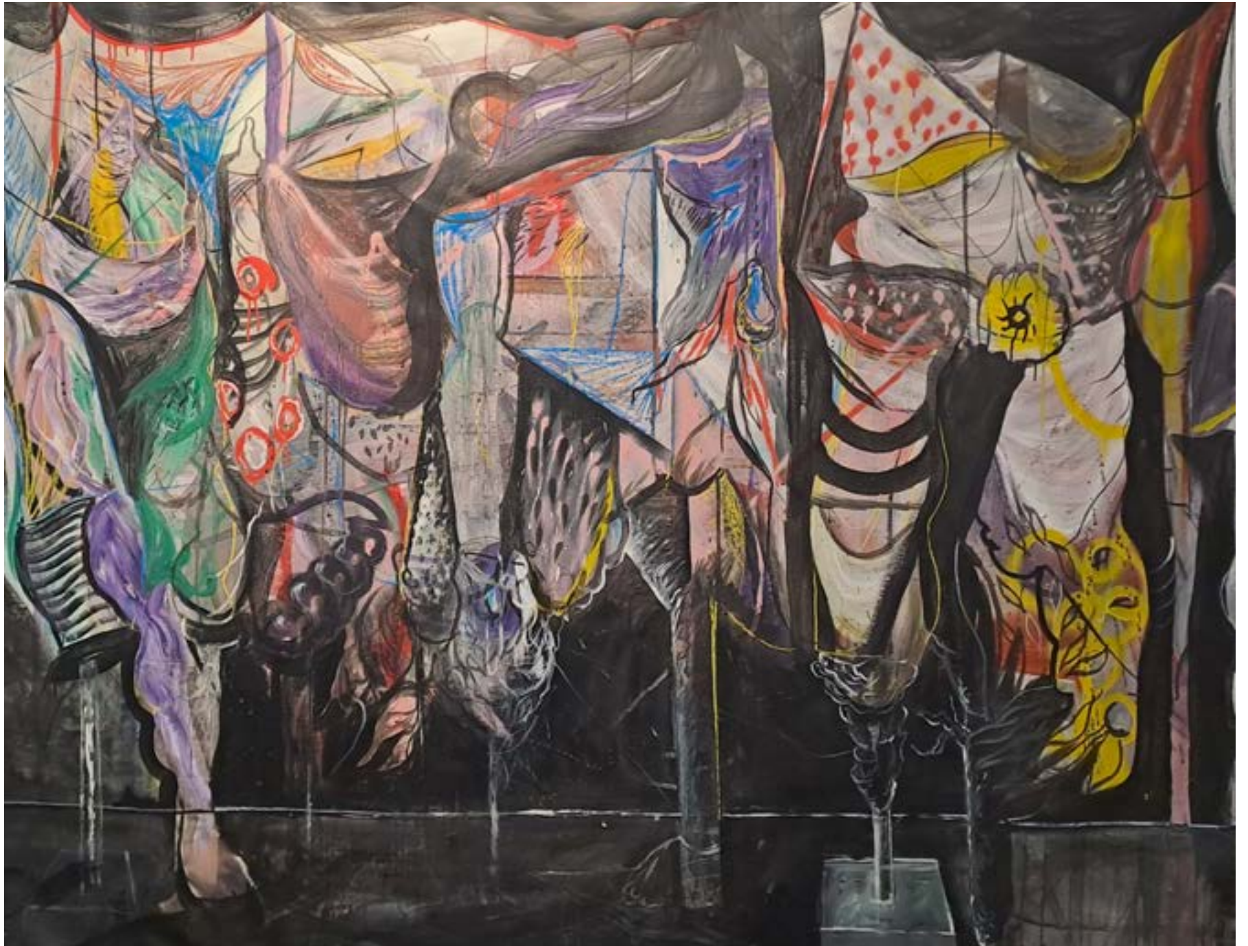
Oussama Diab Theatre , 2024 Mix media on canvas 204 X 152 cm