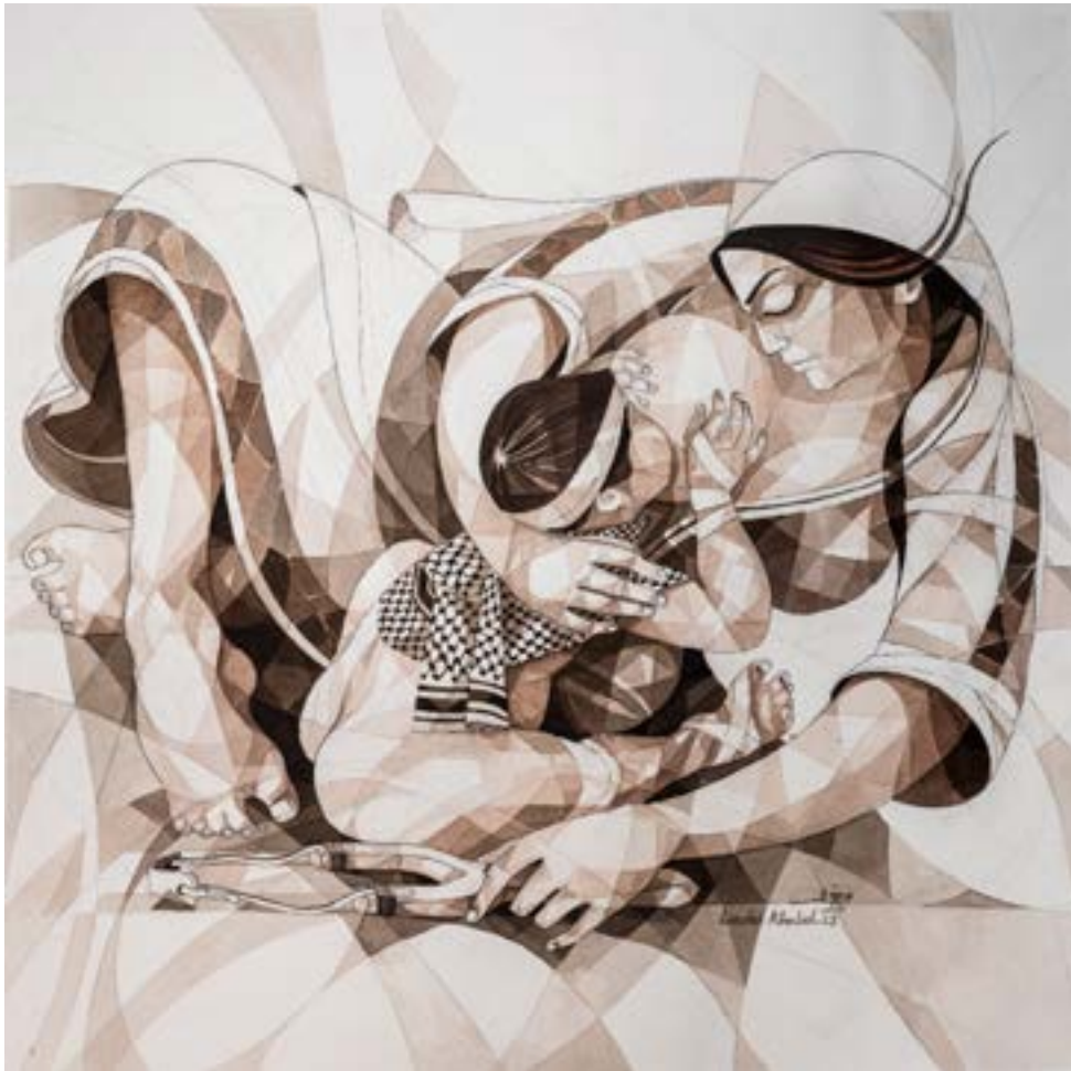
Wadeei Khaled untitled, 2023 Colors and Ink on Paper 52.5 X 52.5 cm