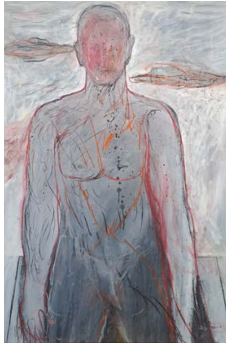
Oussama Diab Theatre. The hero, 2023 Mix media on canvas 120 X 80 cm