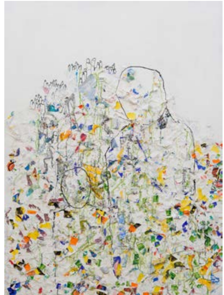
Noura Ali-Ramahi This is Garbage , 2019 Mixed Media Plastic Bags Collage on Wood 120 X 90 cm