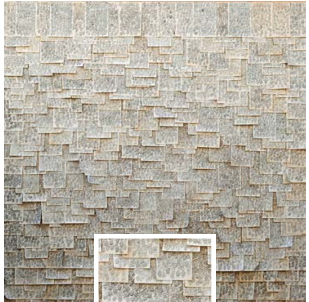
Noura Ali-Ramahi Three Six Five, 2018 Mixed Media on Wood 200 X 200 cm