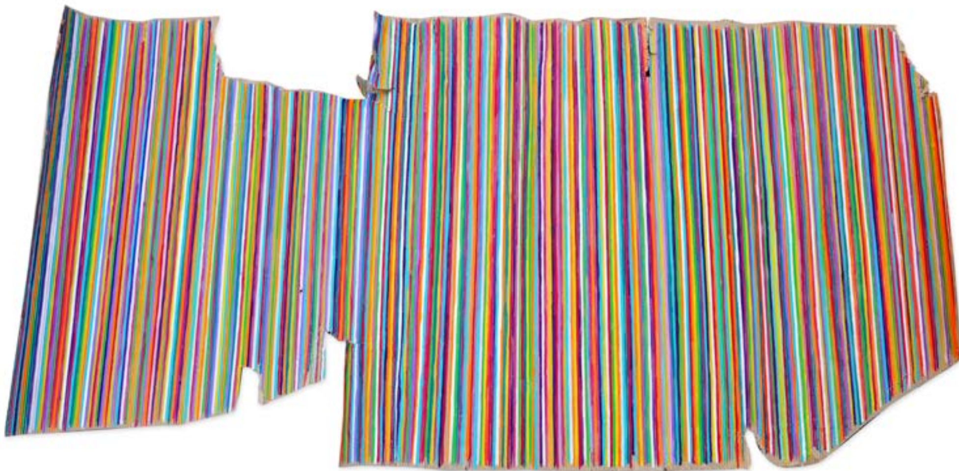
Noura Ali-Ramahi Rainbow , 2022 Acrylic paint on reclaimed packaging cardboard 130 X 270 cm