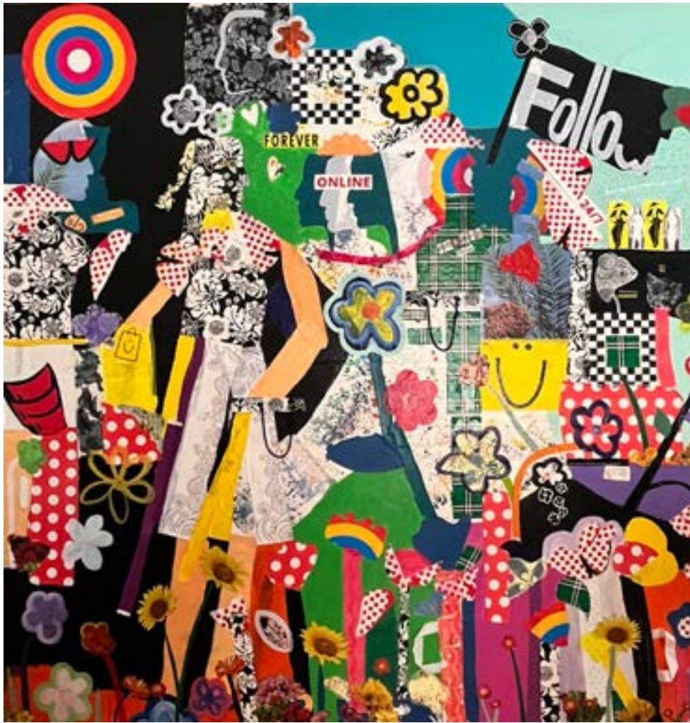
Noura Ali-Ramahi Forever Online , 2020 Mixed Media Plastic Bags Collage on Wood 200 X 200 cm