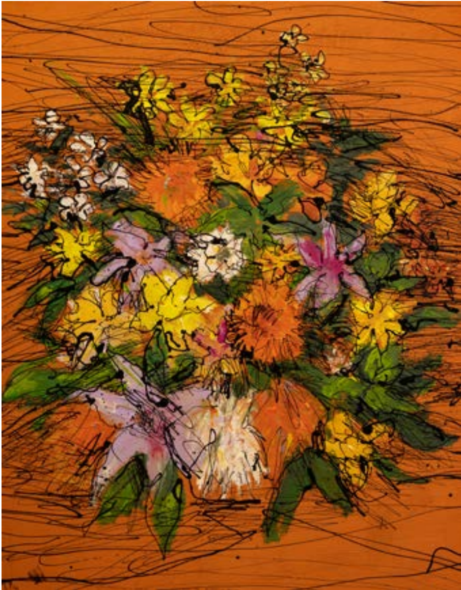
David Daoud The garden of my mother, 2023 Mixed Media 146 X 114 cm