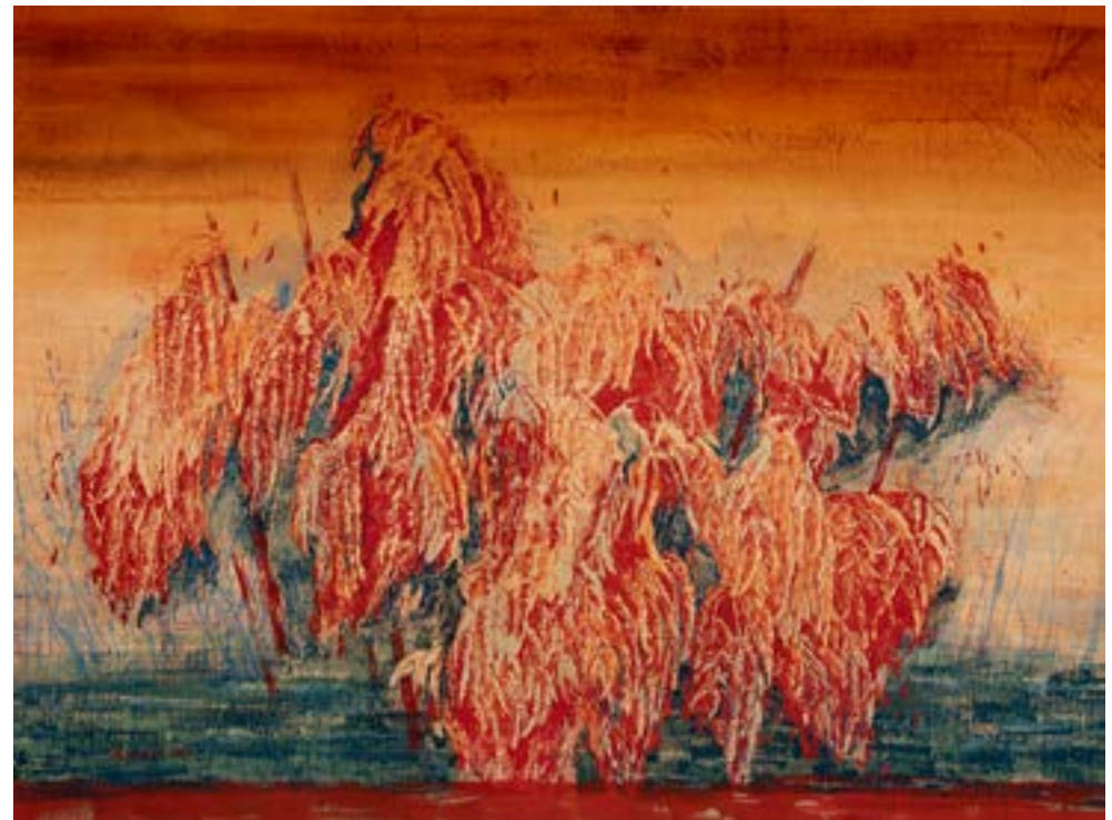
Provided by Zone Pass Art Consultancy