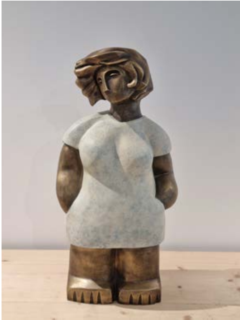
Karine Hochar Carine II , 2023 Bronze Sculpture H65 X W29 X D22 cm