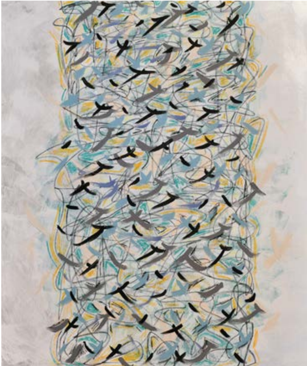
Caleen Ladki Untitled , 2022 Mixed Media on Canvas 175 X 148 cm