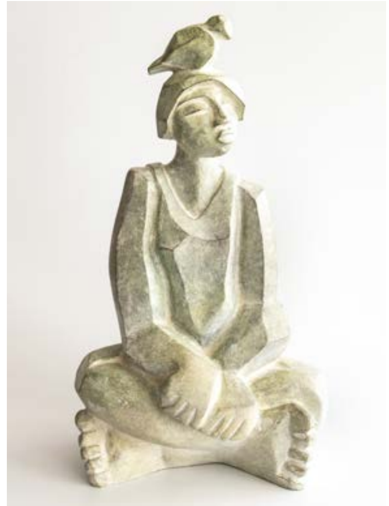
Karine Hochar Guadalupe , 2022 Bronze Sculpture H39 X W23 X D16 cm