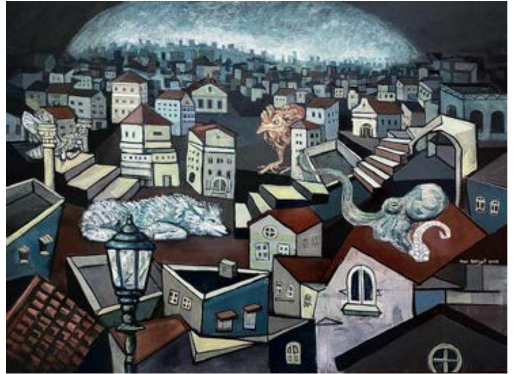
Noor Bhajat Resilience , 2023 Acrylic on Canvas 100 X 120 cm