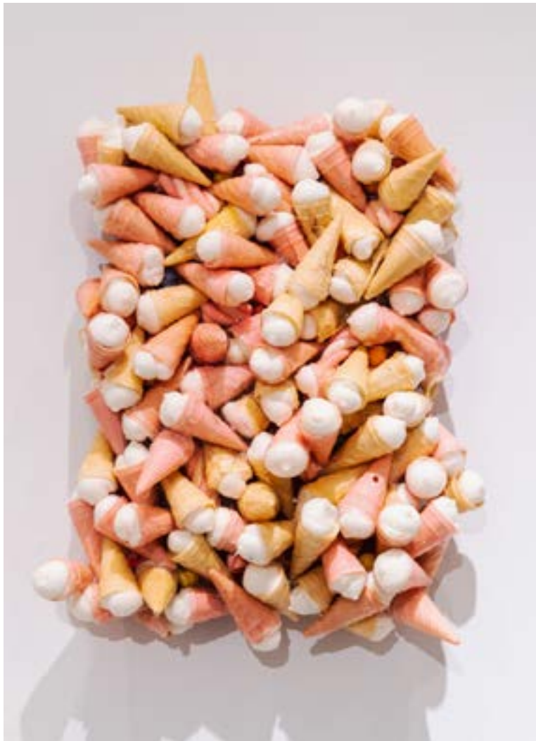
Afra Alsuwaidi Afternoon 02, 2020, Candy on Canvas 36 X 27 cm