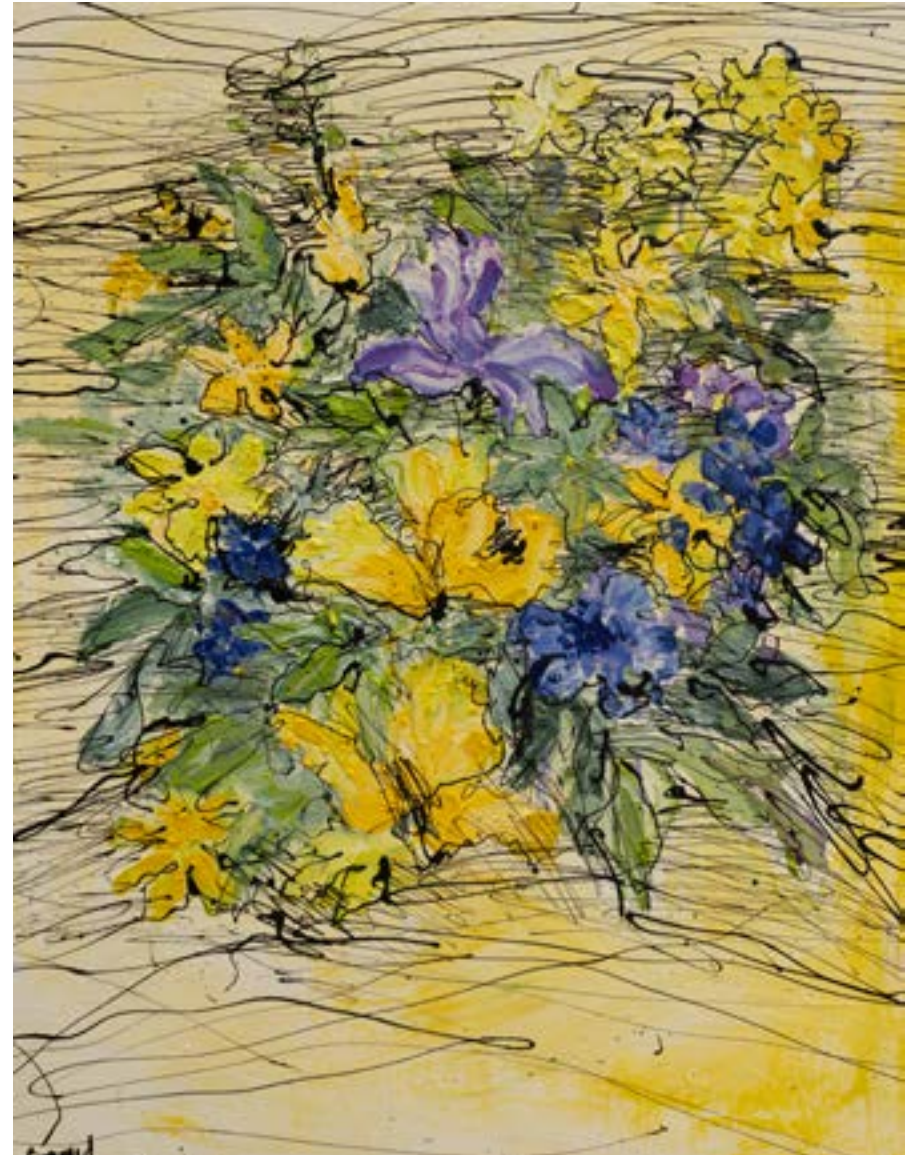
David Daoud The garden of my mother 2, 2023 Mixed Media on Canvas 146 X 114 cm