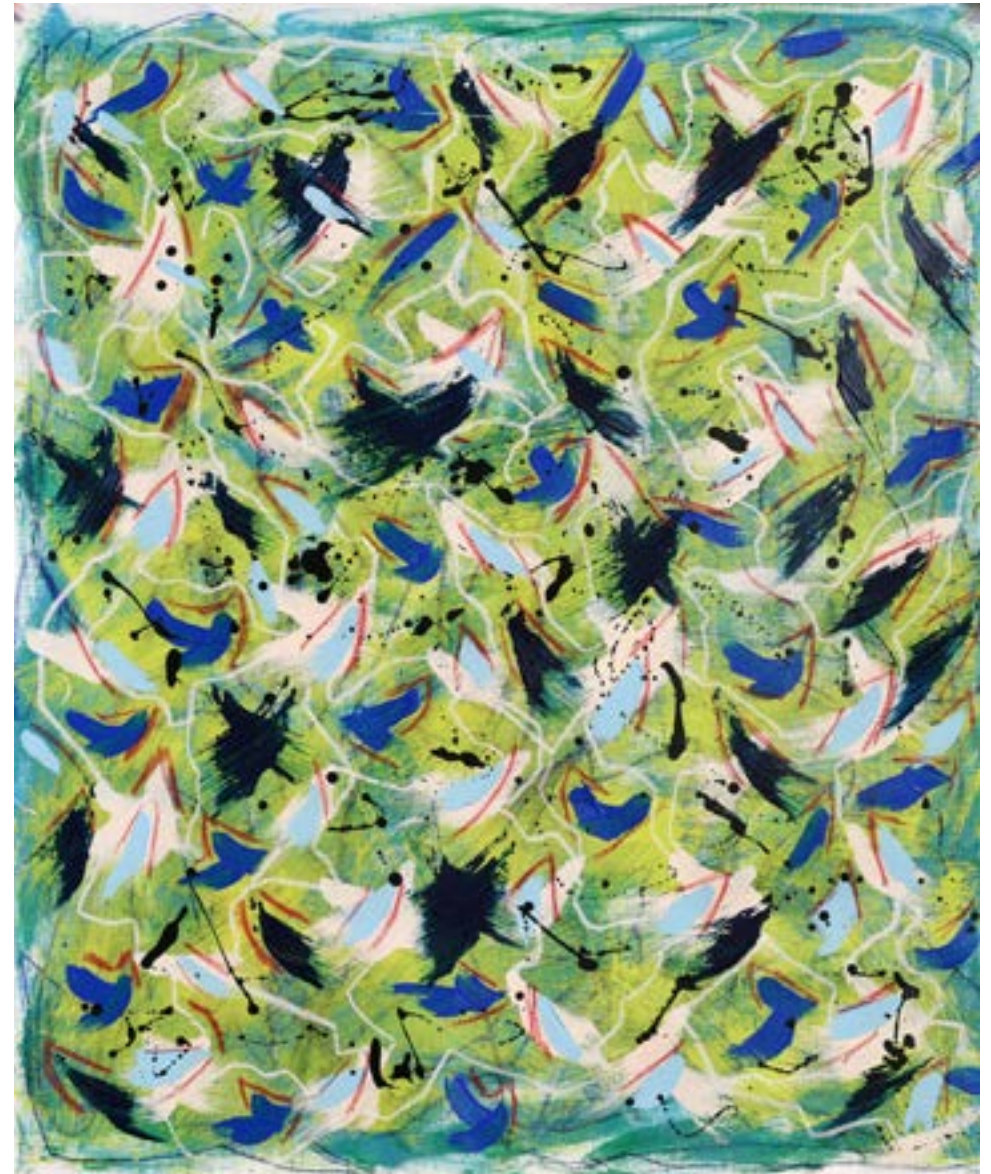
Caleen Ladki Embracing Uncertainty 5 , 2023 Mixed Media on Canvas 120 X 105 cm