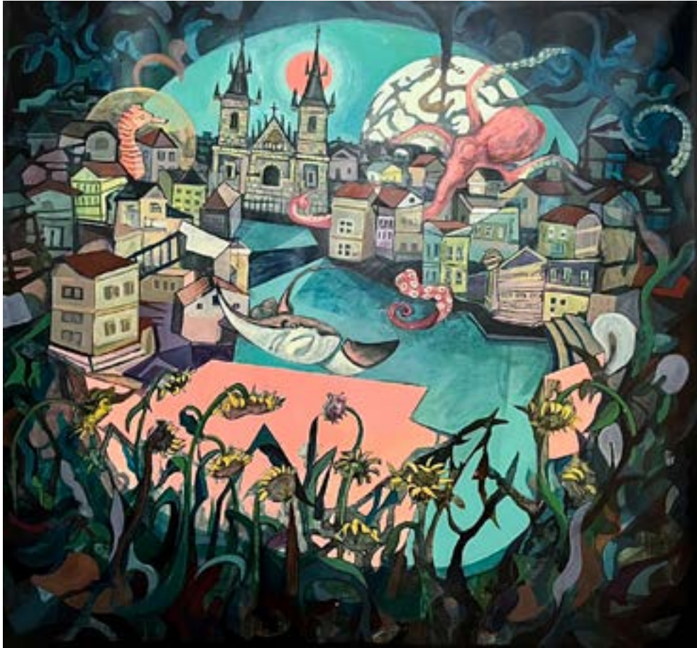
Noor Bhajat Circleated , 2023 Acrylic on Canvas 180 X 180 cm