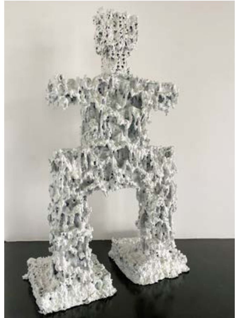
Afra Alsuwaidi The last state of humanity Silver, 2023, ABS Cubes 138 X 87 cm